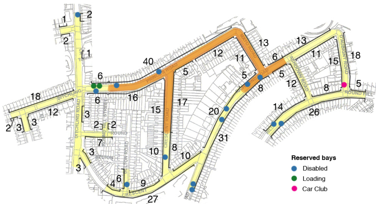
Map showing the total number of parking spaces in the Princes Road area. The zone marked in yellow indicates street areas within 200-400m of the site entrance. The orange zone indicates areas within 0-200m.