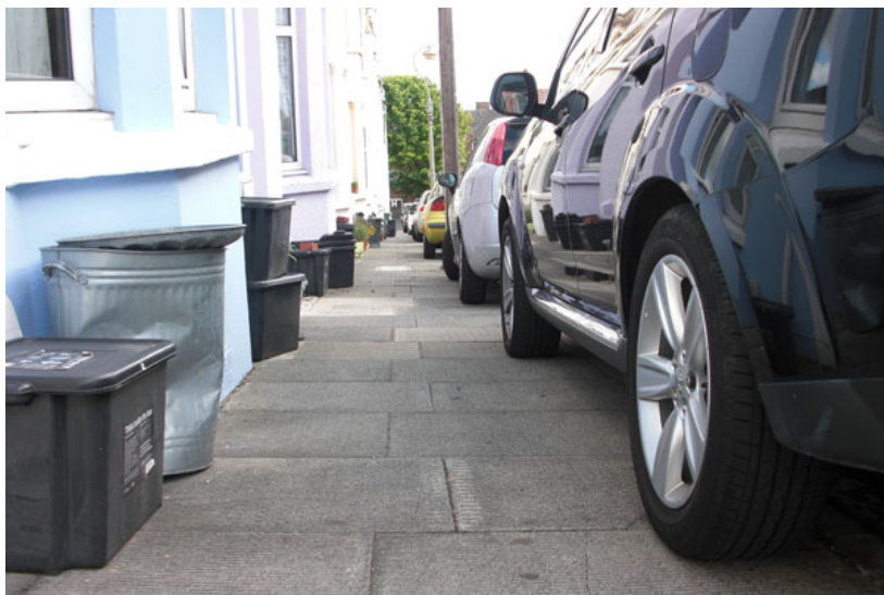
Pavement parking in Belton Road (6.30pm Wednesday 21 July 2010)

The Princes Road area consists of terraced housing, very few properties having off-road parking. As a result, pressure on parking spaces in the Princes Road area is far more acute than the survey included with application BHA2010/00083 suggests. The situation is particularly difficult in the late evenings and parking counts performed during the middle of the day are not representative of the problems faced by residents. We have conducted a series of evening surveys to illustrate the issues that were not picked up in the report prepared on behalf of the applicant.