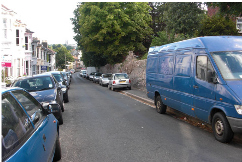
Wakefield Road (6.25pm Wednesday 21 July 2010) Parked vehicles in this road regularly make the pavement on the west side impassable to foot traffic.

We have also collected information on the numbers of vehicles parked in unsafe or illegal positions since this clearly illustrates the pressure on parking in the area. The fierce competition for parking bays results in vehicles parked on corners and double yellow lines. Pavement parking is endemic in streets which are too narrow to accommodate cars on both sides of the road. This causes problems for residents on foot, especially those with wheelchairs or child buggies.