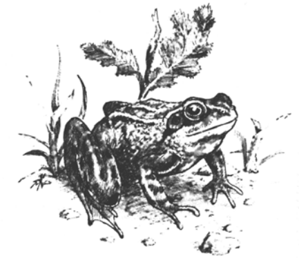
Drawings on this and previous page by Mike Unwin.

Trouble with my waterworks or not, I wouldn't be without a pond: it is such a magnet for wildlife, even here in the city. The birds bathe round the edge