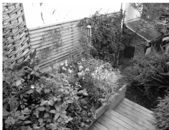
85 Princes Crescent

Alternatively try the Tourist Information Centre of Jubilee Street Library for a copy of the Sussex NGS catalogue.