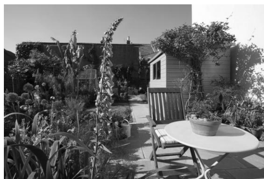
1 Belton Close 118 Richmond Road