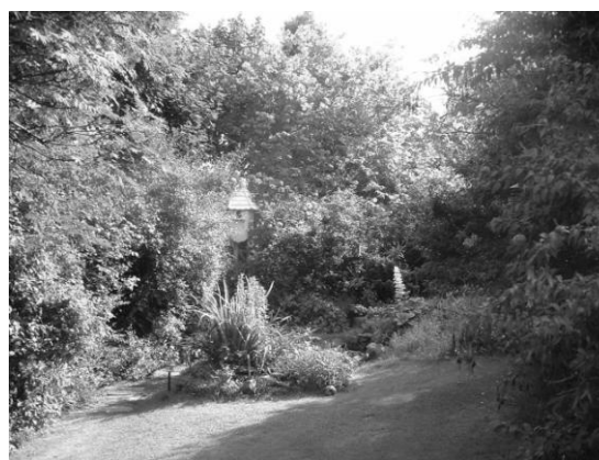
58 Richmond Road