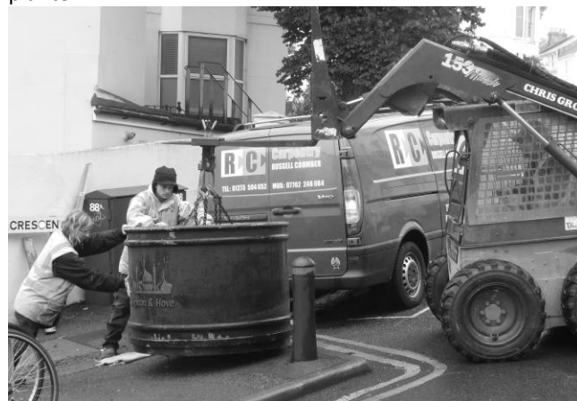
The final positioning of the second planter on its carefully adjusted feet.