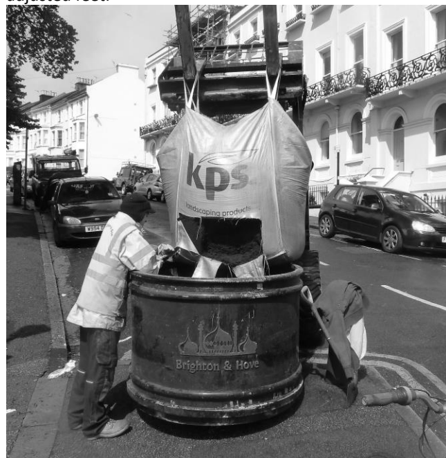
Ashley cuts the sack to release a tonne of topsoil