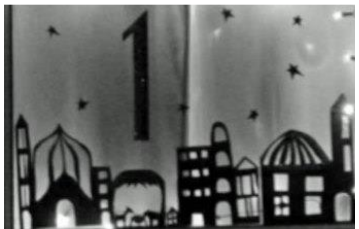
A Belton Road window from December 2011.

Why not get together with a few neighbours and arrange a window dressing event based on the advent calendar? Belton Road has done this for a few years now, and this year some houses in Ashdown and Richmond Roads are planning to do the same. Learn more on page 3.