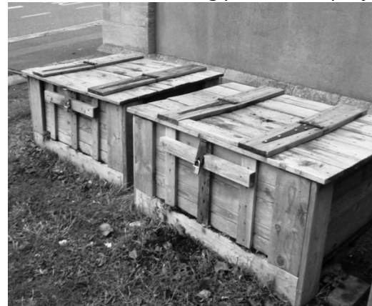
Two community compost bins beside St Peter's Church