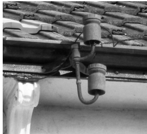
The picture shows a pair of telephone insulators fixed to a fascia board in Princes Road. A modern insulated telephone wire is attached to the upper insulator support, but the original wires bringing telephone services were not insulated so had to be kept apart – thus two separated pots, one for each bare wire. Insulated wires came in during the 1960s.

At 4pm the Lord Lieutenant of East Sussex will be present for the turning on of lights on a Christmas tree. We hope that lots of people will attend to share refreshments, music and seasonal goodwill.