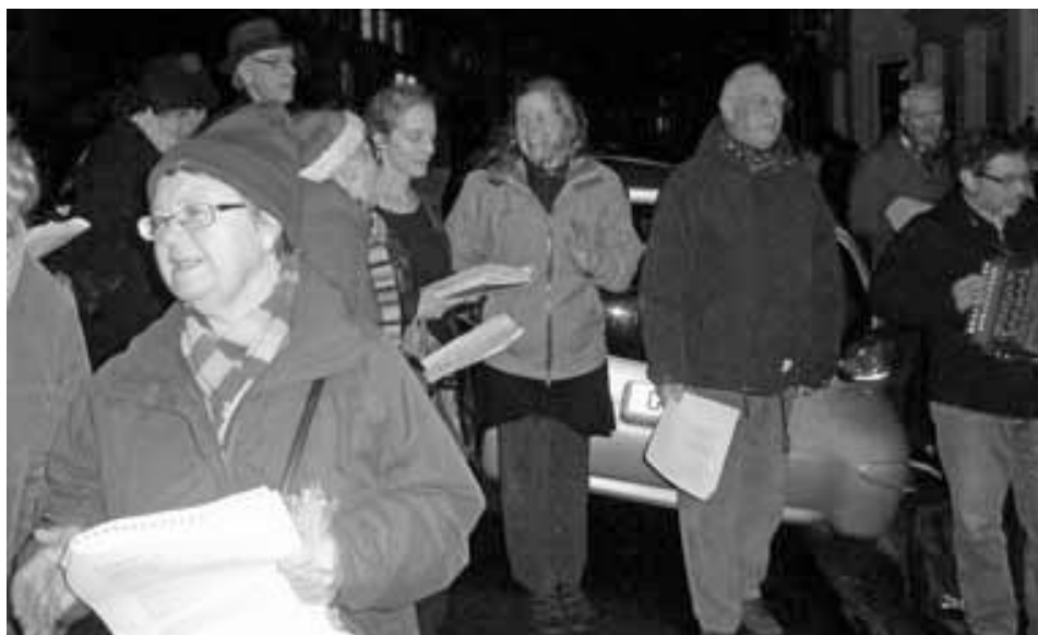
Seasonal singers 2014

Non-emergency police reporting: call 101 if your issue is not urgent or you have a question, alternatively report a crime or incident on contact.centre@sussex.pnn.police.uk