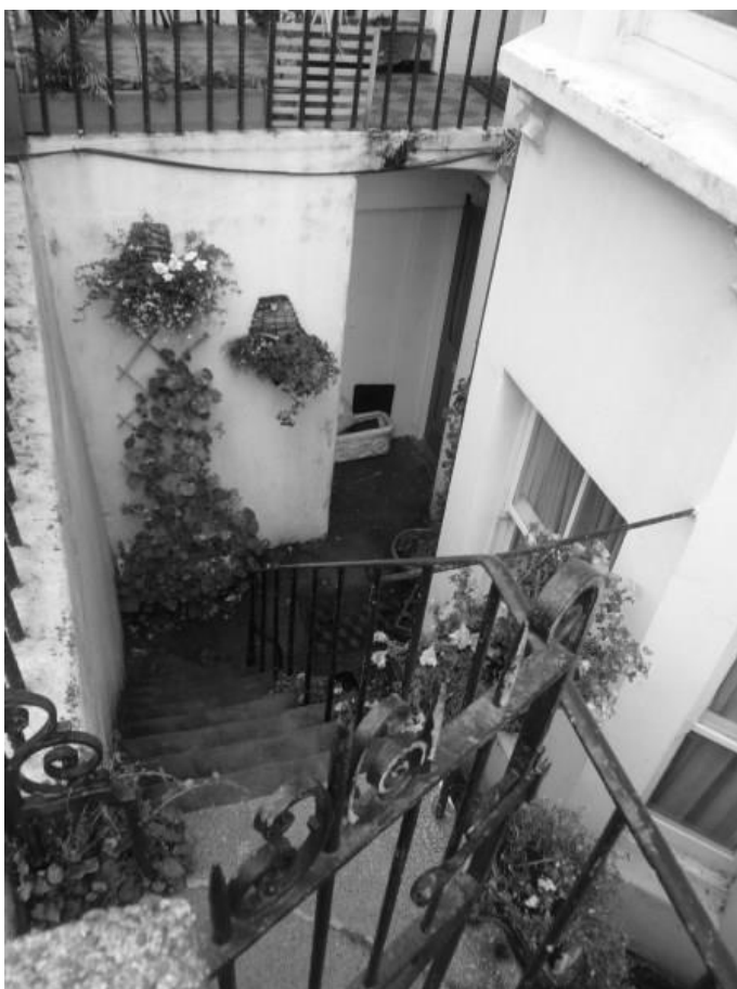
42 Round Hill Crescent. Since the June judging some plantings have passed their best and others (not recognised here) have blossomed. Talk a walk and enjoy them all.