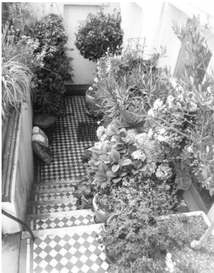
Best basement – 107 Round Hill Crescent