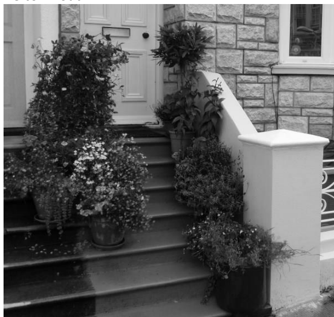
Best frontage – 74 Richmond Road

That one in bottom left is Best Street-front – 19 Belton Road