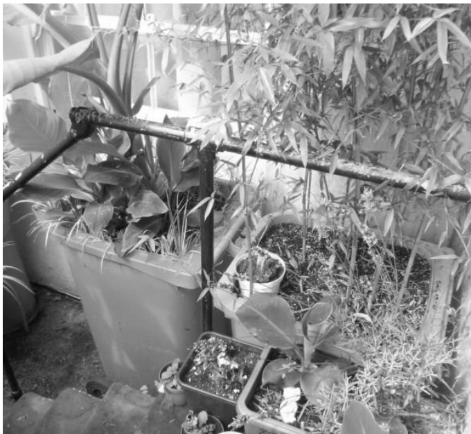
Best unusual containers – 113 Round Hill Crescent. Yes they are wheelie bins, but not Council ones. And finally another basement of quality: