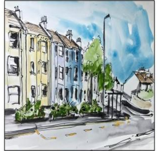
Illustration: Peter Gates