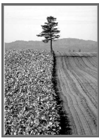
A walk in the country?