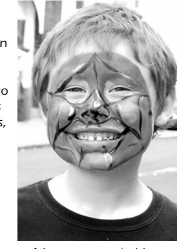
A happy young 'spiderman' fresh from the face painters

moving their cars (which is more than can be said for a ew others). Thanks also go to the donors of raffle prizes, oarticularly olumbing company Floline, who donated the money for a DVD player.