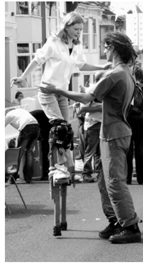
Circus skills in action

Thanks must go to all those who helped both before and on the day, with particular thanks to the residents of Mayo Road who, as well as being helpful in many ways, were most co-operative in