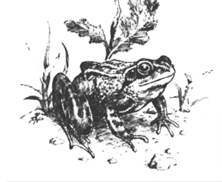
Drawings on this and previous page by Mike Unwin.

Trouble with my waterworks or not, I wouldn't be without a pond: it is such a magnet for wildlife, even here in the city. The birds bathe round the edge