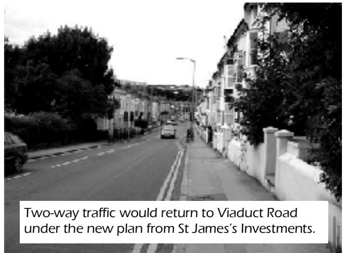
Two-way traffic would return to Viaduct Road under the new plan from St James's Investments.