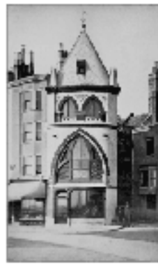
Photograph of the 19th Century Brighton