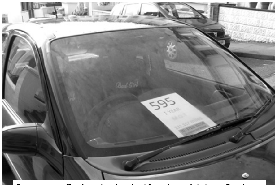
Our nearest offer A car is advertised for sale on Ashdown Road.

Concerns have also been expressed over the suitability and safety of the relatively insubstantial structures on the site. It is believed that the eleven garages, hastily patched in recent weeks, have been used to store fuel and