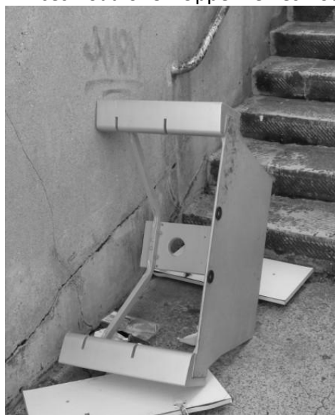
Dumped TV table on the Cat Creep

Or simply write the names of the volunteers, and the shifts or deliveries they can do (see above), plus a contact telephone number, and drop it into one of these addresses: 8 D'Aubigny Road, 36b Princes Road or 51 Upper Lewes Road