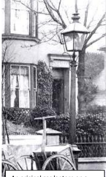
An original gas lantern on a bollard-style post in the Upper Lewes Rd, about 1916.