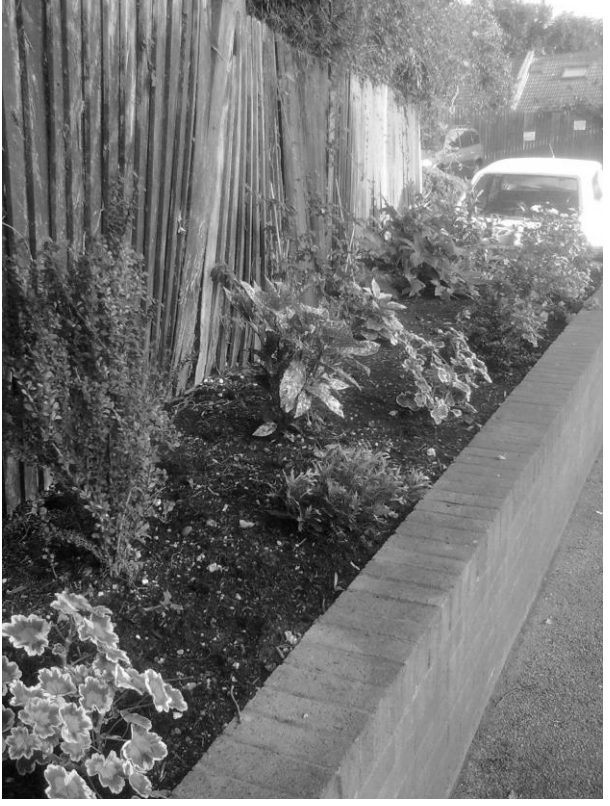
But just look at it now

The first day was hard work but thanks to the efforts of the MCRA and members of the Round Hill Society, we tackled a large proportion of the preparation needed.