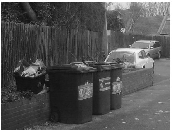
Before we started this bed was a tipping ground

It all started on a cold day in May. It was the day of the great Round Hill Clean Up and Mayo Court Residents' Association (MCRA) were aiming to use this day to commence their Gardening Project, having received a grant from the St. Peters and North Laine Community Development Fund.