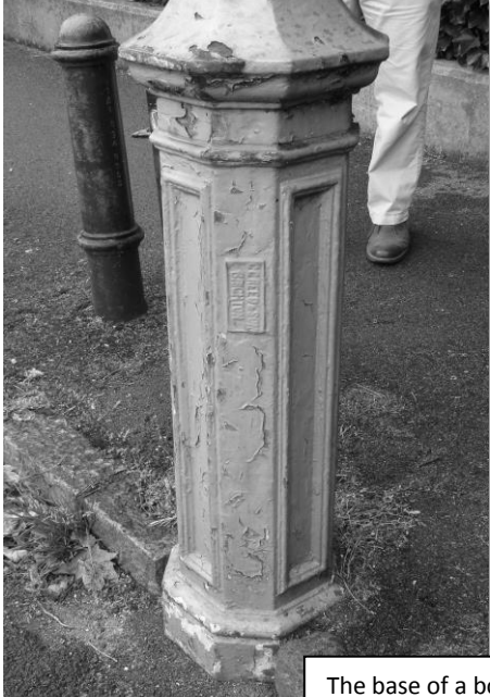
The base of a bollard-style lamppost with maker's label just visible