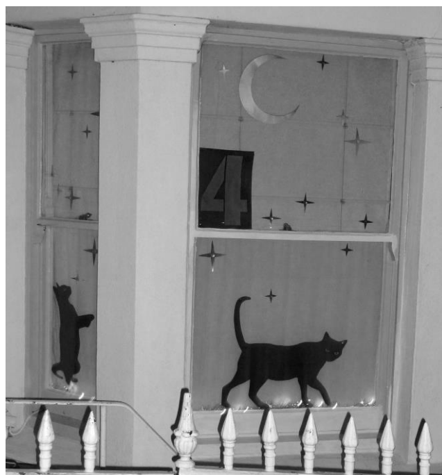
Near the top of the Cat Creep