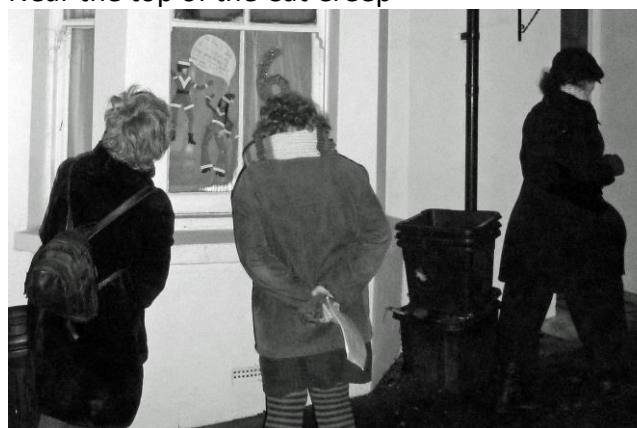
Examining the sixth day in Belton Road