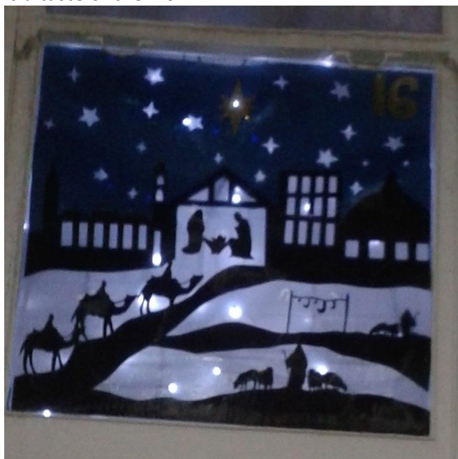
A Round Hill Crescent nativity scene

The well-established Advent Windows of Belton Road spread across Round Hill at Christmas, with decorated windows appearing in Richmond Road and Round Hill Crescent. If you missed them here is a taste of the work.