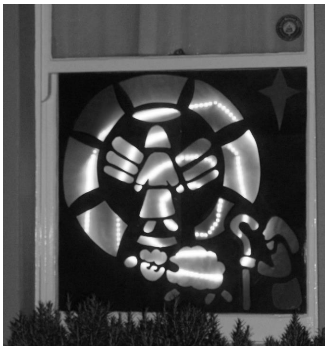
While shepherds watch their flock by night