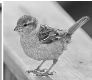
female house sparrow

In the last edition Jan Curry wrote a piece about house sparrows in her garden. It seems that there is a growth in their numbers on Round Hill, but they are still nowhere near as common as they used to be.