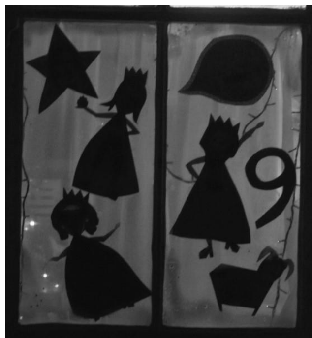
Three Kings at 17 Belton Road

Penny Morley Older People's Council 68 Crescent Road 01273 687319