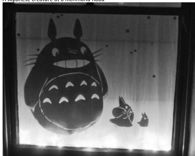
A Japanese creature at 6 Richmond Road

They can print T-shirts for you, repair your watch or i-pad, and even design a thing and 3-D print it for you. Ross is proudest of the six camera rig he built for suspension below a drone. Connor said the oddest electronic gadget he has fixed was a bat detector.