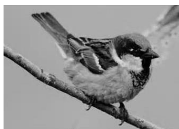
Male house sparrow