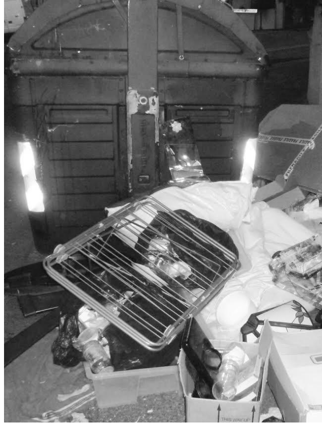
Clothes drier dumped with recyclable cardboard.

From time to time you may have useful items to get rid of. It's OK to put them on your garden wall or front step with a note saying please take, but please don't leave them overnight. You will have more success if you also tell local folk that the item(s) are available by putting the information on our Round Hill Noticeboard Facebook page. You might even find things you need advertised there.