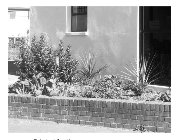
Printed for the Round Hill Society