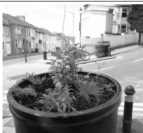
East end planters newly planted up.

If you've seen the planters at all you will have noticed that they were set up on sloping ground, and until recently every one of them had a big space showing on the downhill side. By the middle of August Ashley Groom (the son of Chris and Tina who installed the planters for us) had made and fitted steel skirts to cover the yawning spaces, and they are now painted black to match the planters.