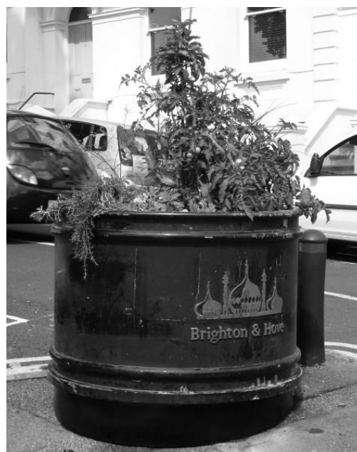
New skirt fitted and painted

BULB PLANTING 10.30am Sunday 28 th September