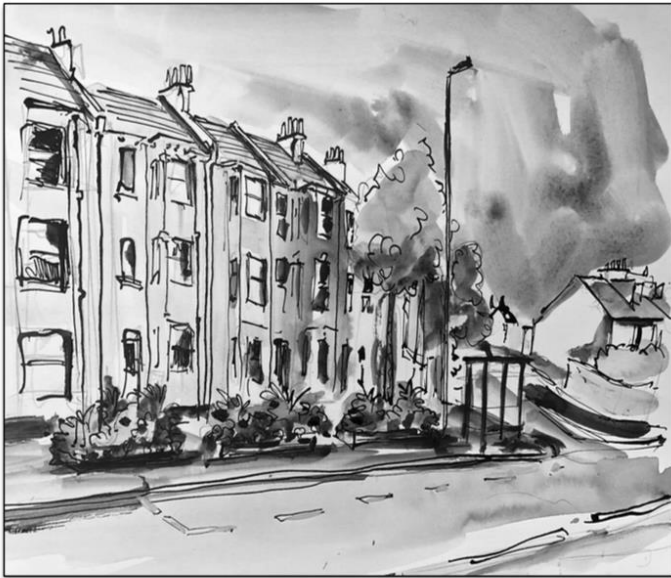
Illustration: Peter Gates

The man from the council he said "Yes" (but...)!