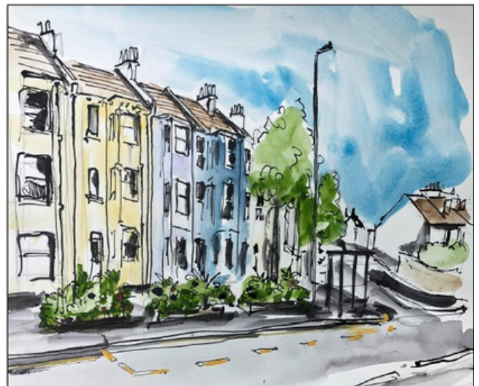
Illustration By Peter Gates

The planters are being built and installed by the Wood Store Brighton. The pocket park will also eventually include a new community noticeboard and a "Welcome to Round Hill" sign