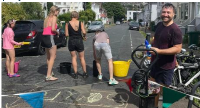
Written by Laura-Kate Roe

After a bit of friendly intervention to reign in some overly enthusiastic grown-ups, and with water supplies fully topped up, the games began. The streets were soon filled with the sounds of splashing water and joyful shrieks as everyone joined in the playful chaos.