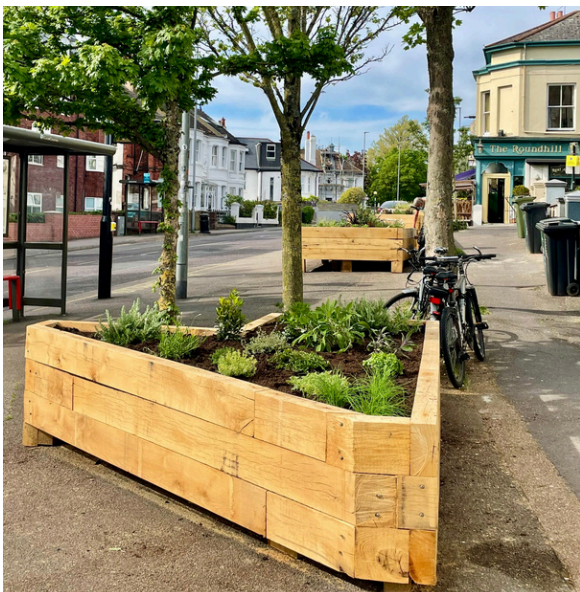
One of the four planters

The pocket park consists of four large wooden planters, made and installed by a team from the Brighton Wood Store. It is situated on the wide tarmacked walkway alongside the southbound bus stop at the junction of Ditchling Road and Prince's Crescent. The site was chosen to provide a welcoming public green and social space, as well as to deter pavement parking.