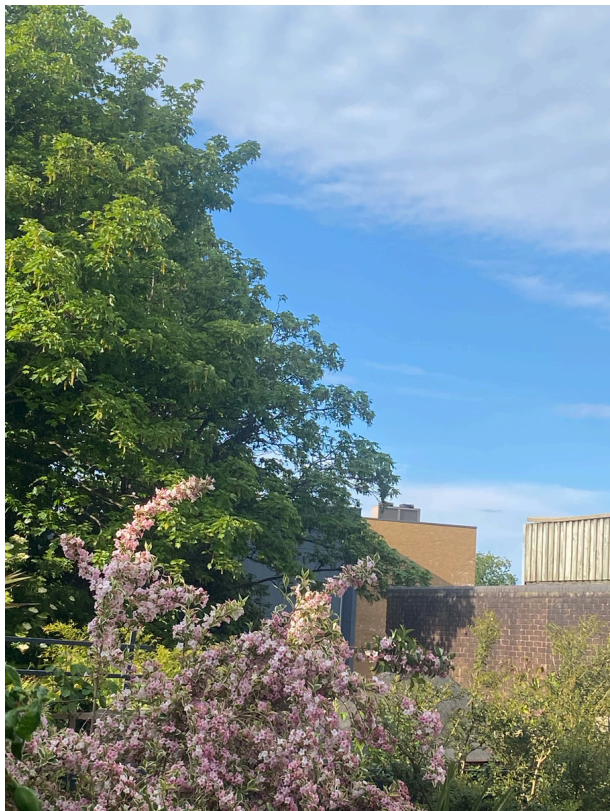
Image of the units from a back garden.