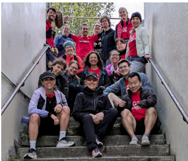
Volunteers at the last action day

This year nature charity WWF and GoodGym are collaborating on hundreds of events involving a Workout for Nature. In Round Hill we saw an impressive fifteen GoodGymers take part, who painted over graffiti tags on the Cat's Creep stairway, getting rid of stubborn weeds on Wakefield Road, clearing ivy, and litter picking across the area.